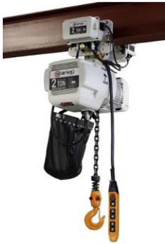
Hoists & Trolleys

Contact Your Starke Representative for More Information on Products to Help Maximize Your Workplace Efficiency