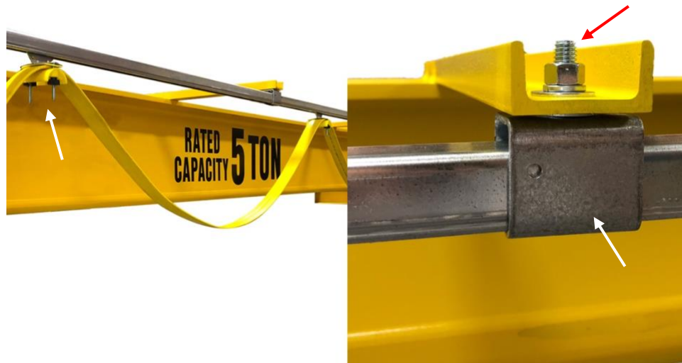
1.1.2 Festoon System Trolley, Bracket, and Hanger

Installing things in the order listed will result in the fastest and easiest assembly.