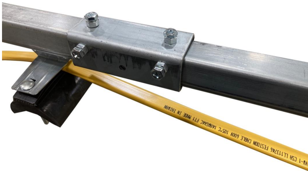
1.2.1 Track Coupler S100-TC

▲IMPORTANT NOTE: There should be one track hanger with a bolt on the side of it. This hanger holds the track from sliding. Do not overtighten this side bolt. Tighten bolt enough that the track will not slide easily and then tighten the jam nut to hold in place.