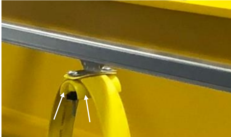
1.3.1 Festoon Trolley with Clamp

1.3 Hold each festoon trolley and loosen the 2 bolts that hold the plastic clamp plate on the festoon trolley. Then roll the festoon trolleys into the festoon track without the festoon wire installed.