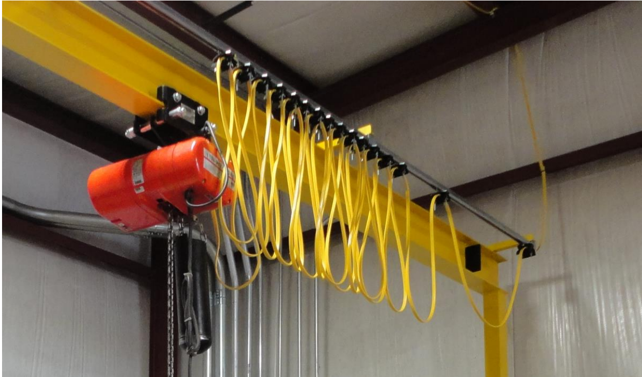
1.5.1 Festoon System with a Hoist on a Crane

▲IMPORTANT NOTE: For ease in measuring, festoon wire typically has 1 ft measurements printed on it.